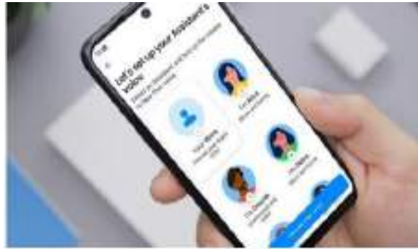
The new feature will be available to paid users in the coming weeks.

Truecaller, one of India's most popular caller ID services, is all set to introduce a new AI-powered feature that will mimic your voice to answer calls on your behalf. The new AI Assistant is powered by Microsoft's 'Personal Voice', a technology the tech giant unveiled in November last year as part of the Azure AI speech. The functionality will be available to Truecaller Premium