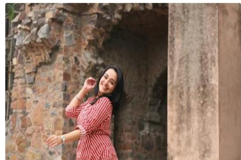
Actor Apoorva Arora visited Pir Ghaib in Kamla Nehru Ridge to mark World Heritage Day.

When actor Apoorva Arora recently visited Delhi, she didn't just indulge in the pleasures of home; she also delved into its rich history. Making a pit stop at Pir Ghaib — which got its name after a saint who had made the place, his home, vanished into thin air — in Kamla Nehru Ridge, near North Campus, she expresses her excitement, saying, "Just being here and knowing that it's built by Feroz Shah is making me feel quite excited.