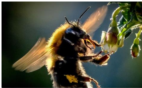
Bumblebees can surprisingly withstand days underwater, according to a study published Wednesday (AFP)

Bumblebees can surprisingly withstand days underwater, according to a study published Wednesday, suggesting they could withstand increased floods brought on by climate change that threaten their winter hibernation burrows. The survival of these pollinators that are crucial to ecosystems is "encouraging" amid worrying global trends of their declining populations, the study's