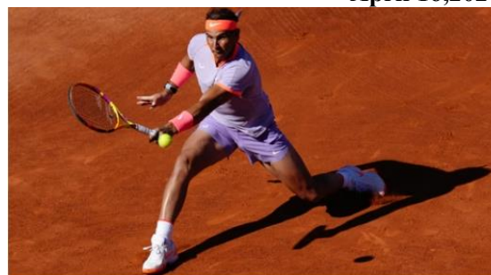
Spain's Rafael Nadal returns the ball to Italy's Flavio Cobolli during the ATP Barcelona Open "Conde de Godo" tennis tournament singles match at the Real Club de Tennis in Barcelona.

Rafael Nadal was able to play on clay for the first time since winning the French Open in 2022 and showed flashes of his usual brilliance in a solid display. Rafael Nadal made light work of Flavio Cobolli on a triumphant return from injury at the Barcelona Open on Tuesday. The 22-time Grand Slam champion had not played an ATP Tour match since January but dispatched the Italian 6-2, 6-3 in one hour and 25 minutes to reach the second round.