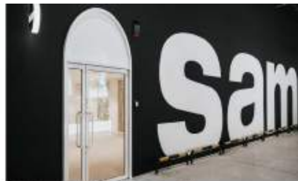
Exterior of the Singapore Art Museum at Tanjong Pagar Distripark.

The Singapore Art Museum (SAM) has announced that it will remain at Tanjong Pagar Distripark for the foreseeable future. SAM's previous locations, the old St Joseph's Institution building and the former Catholic High School building in Queen Street, have been closed since 2019 as a result of a SGD 90 million architectural heritage preservation project. Singapore's Minister for Culture, Community and Youth Edwin Tong announced on May 8 that potential uses of St Joseph's Institution are under evaluation and will be shared at a later date. No immediate plans were announced for the Queen Street building.