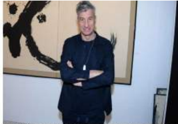
NEW YORK, NY - MARCH 4: Maurizio Cattelan attends The Artory Show 2020 Preview Day on March 4, 2020 at Pier 54 in New York City.

Artist Anthony James has sent a legal letter to Maurizio Cattelan accusing the latter of making strikingly similar artwork to his own, reports Artnet News. Both artists opened shows in New York featuring panels of reflective metal sheets shot with bullet holes. The only physical difference between them is that Cattelan's panels are plated in gold, while James has been making similar sculptures for a decade on mirror-polished stainless steel..