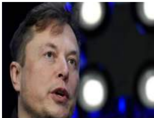
Elon Musk said the decision to ban Trump amplified Trump's views among people on the political right.

Read More: https://www.livemint.com/news/world/elon-musks-x-to-soon-host-town-hall-with-donald-trump-news-stormy-daniels-after-guilt-verdict-in-hush-mone-y-trial-11717216648094.html