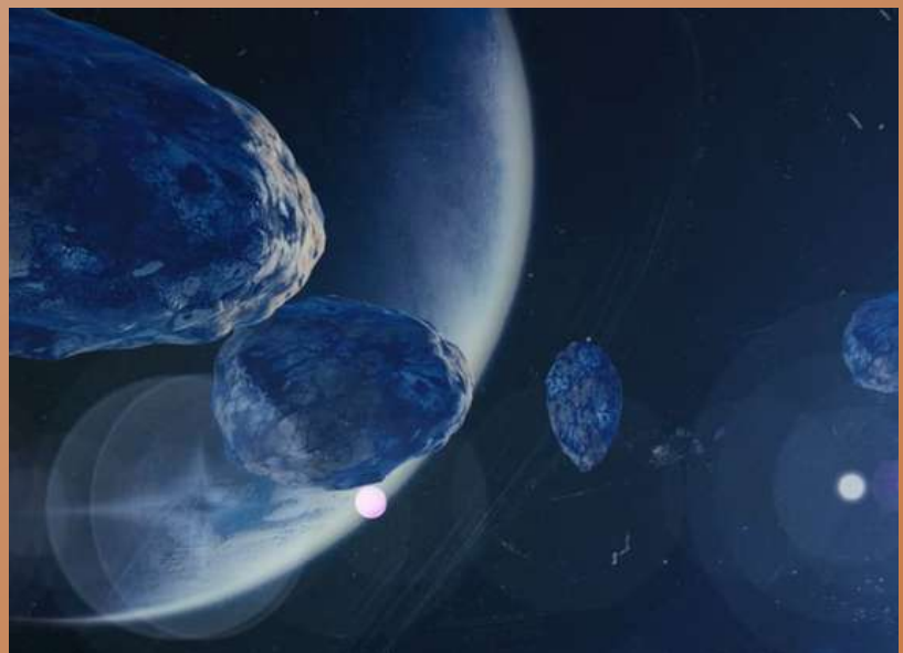
Asteroid 2021 BL3 belongs to the Apollo group of asteroids, according to NASA. Check details.

There have been many instances of asteroids passing by Earth in the last few weeks. Just yesterday, a 45 feet wide asteroid flew past the planet at a distance of approximately 3 million kilometers. Due to such close calls with asteroids, NASA, ESA, and other space agencies have developed technology to track these space rocks in their orbits, and even deflect them in case a potential impact scenario develops. Using its tech, NASA has now shed light on an asteroid that is expected to pass Earth today, January 23. Know all about this close approach.