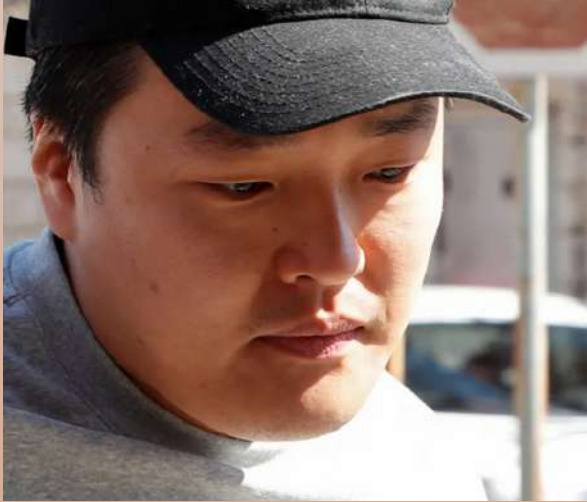
Do Kwon being taken to court in Montenegro in March 2023, Credit - BBC