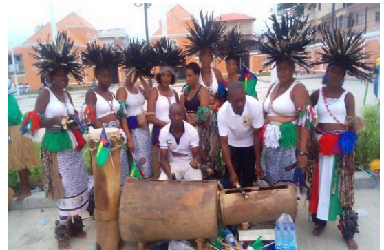
Credited by:Sumit Arora

https://currentaffairs.adda247.com/international-lusophone-festival-to-be-held-in-go/